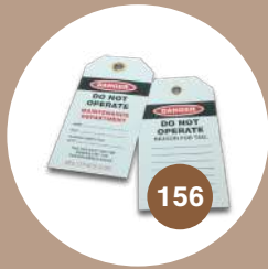
Do Not Operate, Maintenance Department Tags