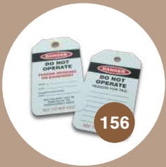
Person Working on Equipment Tags