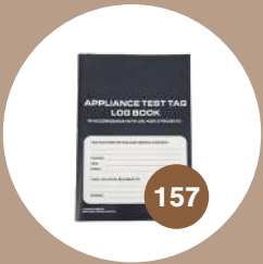
Test Tag Accessories