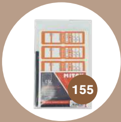
MITAY Heavy Duty Test Tags