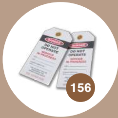
Do Not Operate, Service in Progress Tags