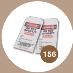
Do Not Operate, Electrical Department Tags