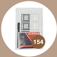
TUFTAG Heavy Duty Test Tags