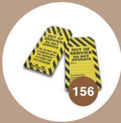
Out of Service, Do Not Operate Tags