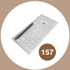
RCD Safety Tags