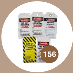
Lockout Tags Pack