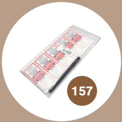
Faulty Appliance Safety Tags