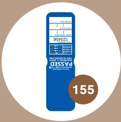
MITAY Customised Heavy Duty Test Tags